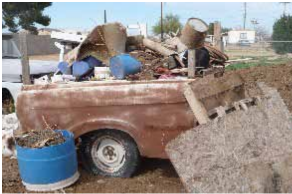
Example of some of the refuse removed.

Volunteers working with the Recycling Association of Maricopa noted the following amounts of recyclable materials removed from the Redevelopment District Area at the conclusion of the effort: