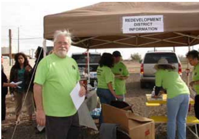
District Committee volunteers share hot dogs and information.

On the Saturday prior to each cleanup week, the Redevelopment District Citizens Advisory Committee Members hosted a neighborhood get-together with refreshments, information and applications for funding of outdoor home improvements.