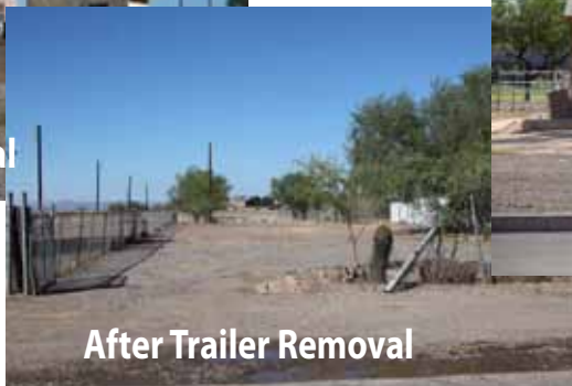
After Trailer Removal